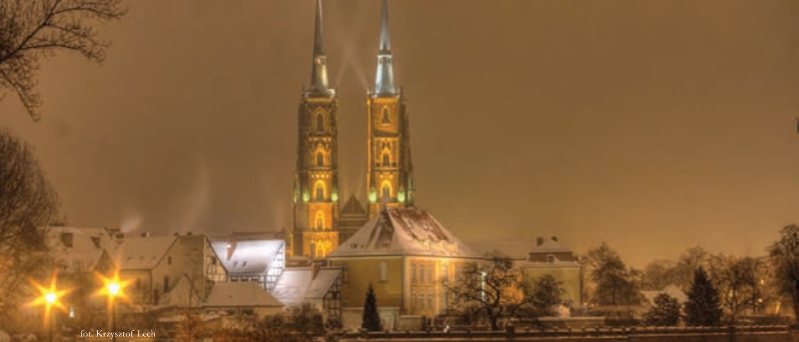
fol. Krzysztof Lech