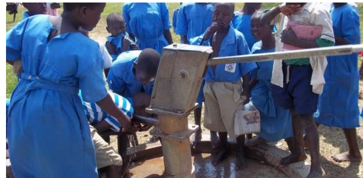
Water supply installation