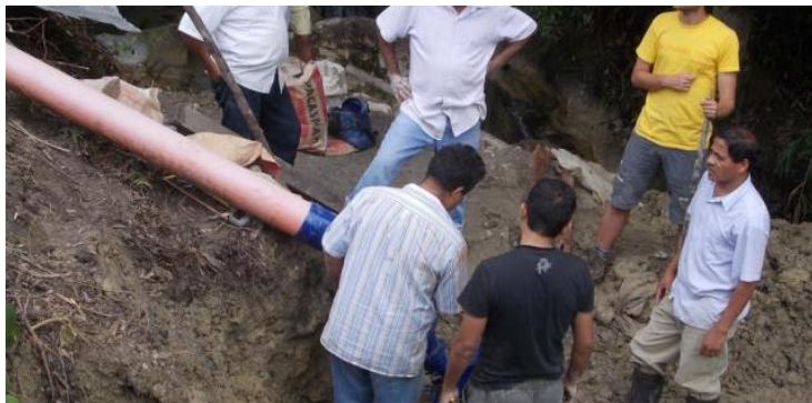
Humasol project in Peru